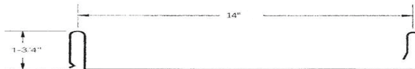
TYPICAL ASSEMBLY PROFILE VIEW

Fastener: # 10 Pancake Head Wood Fastener